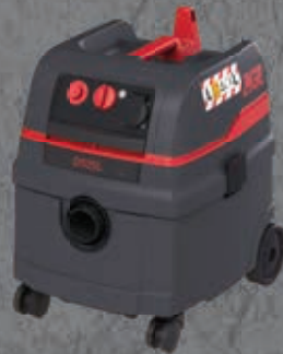
Vacuum Cleaner DS25L 305-00371-000-001