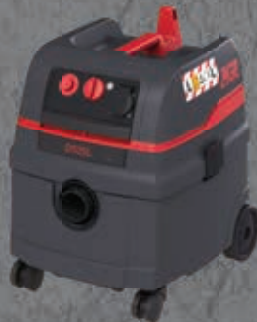
Vacuum Cleaner DS25L 305-00371-000-001