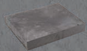
Sharpening plate 305-00372-000-001